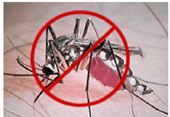
Avoid being bitten by mosquitoes to protect against WNV infection.

The National Pesticide Information Center (NPIC) can be contacted by telephone at 1-800-858-PEST (1-800-858-7378), 9:30 a.m. to 7:30 p.m. eastern standard time, 7 days/week, or link to the NPIC Web site: http://npic.orst.edu