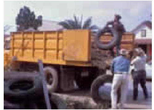
Remove discarded tires from the worksite.